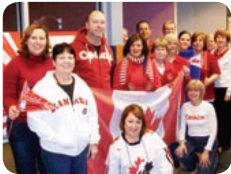
Our staff showed their Olympic support and Canadian pride during the Winter Olympics.

Essex Kent Boys Junior Golf Tournament Calloway in School Program We Care for Kids Goodfellows Downtown Mission Salvation Army International Women's Day Make A Wish Foundation Hiatus House Alzheimers Society Hotel Dieu Grace Hospital Youth sports organizations Big Brothers & Big Sisters Windsor and District Soccer League Victim Services Girls & Boys Baseball & Hockey In Honour of the Ones We Love Unemployed Help Centre Windsor Essex County Senior Sports Organization